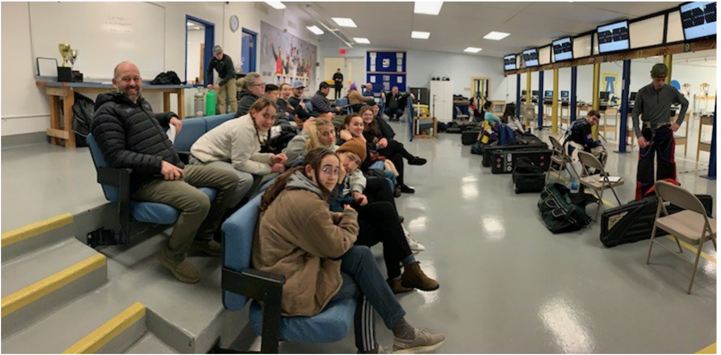
Spectators and competitors at the UAF Nanooks range.